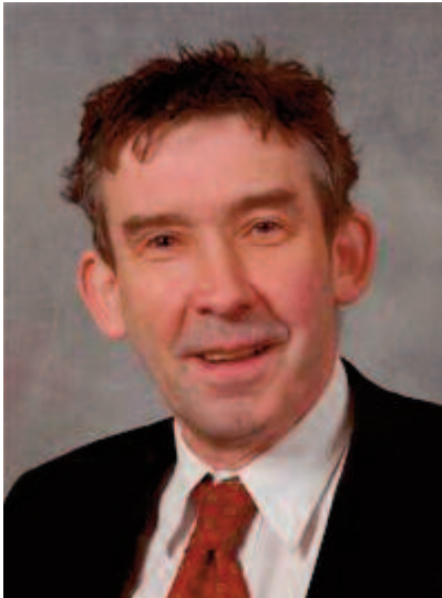
Councillor Huw Jones, Cabinet Lead Member for the Welsh language

To this end, the Council will work with partners to make linguistic planning a more strategically focussed outcome, with the aim of ensuring that all partners work together towards the same objective: to protect and enhance the Welsh Language in Denbighshire.